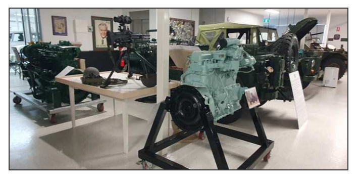
1965 Rolls-Royce B60 4.26 litre petrol engine, used in UK Defence Forces. Daimler Ferrett