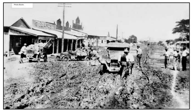
Edith Street, Innisfail Photo taken September 1946