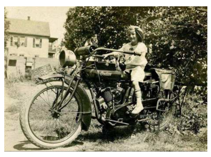
Woods Indian Motorcycle

Photo taken approx 25th October 1937