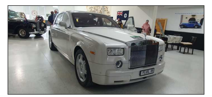
2007 Rolls-Royce Phantom Sedan