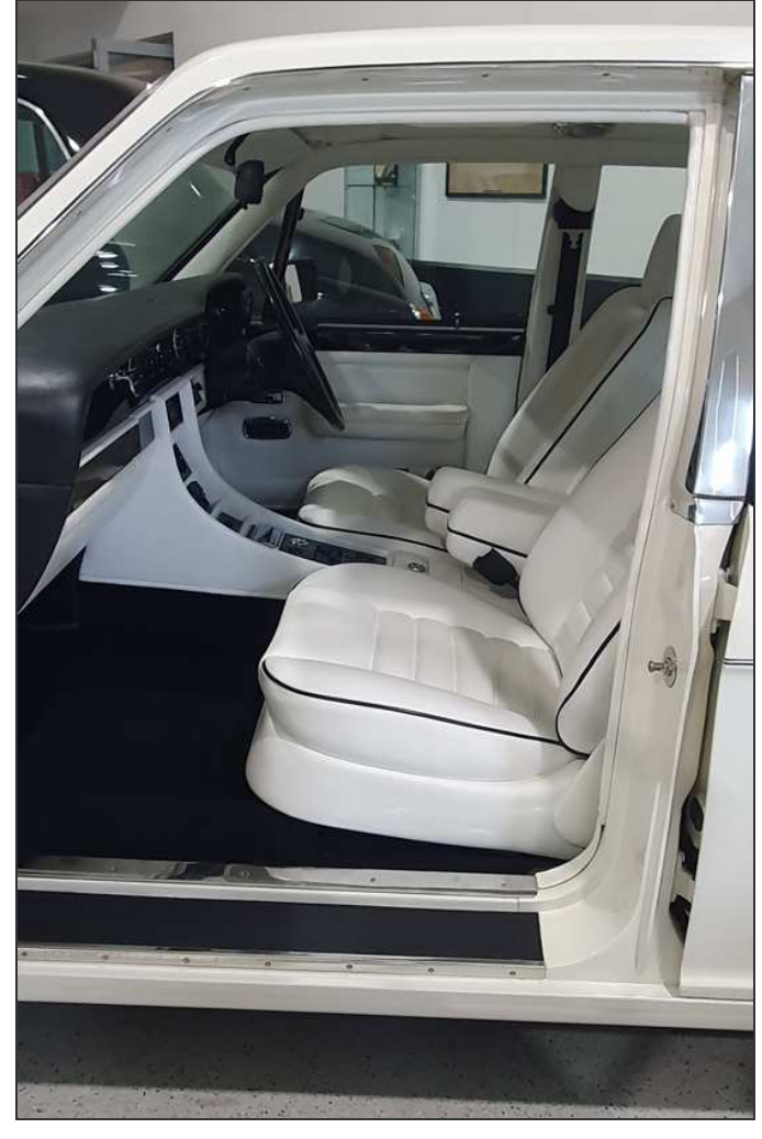
The Coolum Showroom is open on the first Saturday of the money, in conjunction with