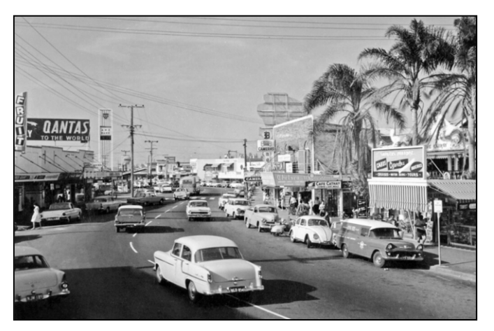
Photo taken on 12th January 1961

In 1965, the world water skiing championships were held at the Surfers Paradise Ski Gardens, now known as Sea World. This was the first international event to be held on the coast.