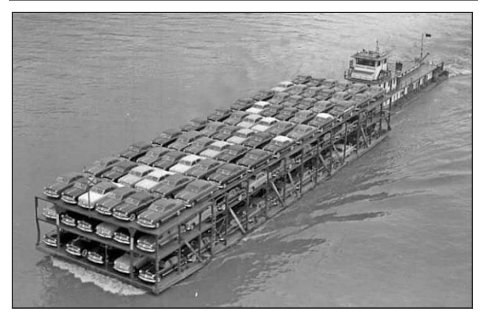
August 19th, 1949. Mississippi River at St Louis. 60 on each level... 180 in all.