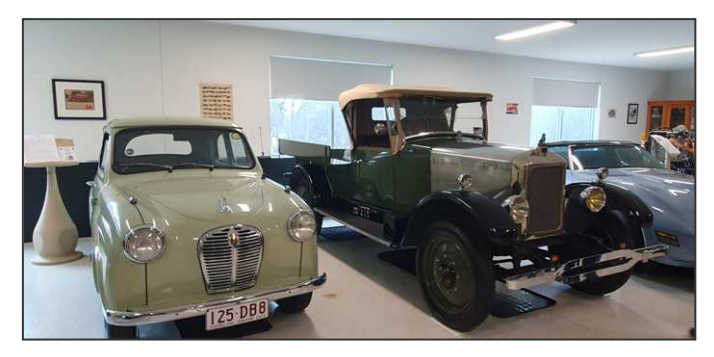
Austin, Armstrong Siddeley utility, Corvette