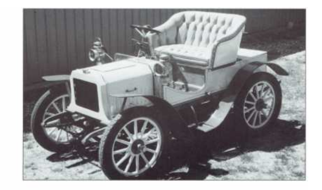
143 1904 SIDDELEY 6HP TOURING CAR OPEN TOURER

3. Last appearance of the car was in a sale catalogue for a Shannon's auction in March 2000.