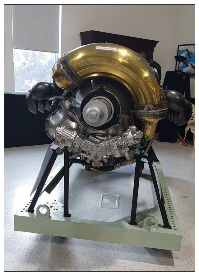
1945 Rolls-Royce Merlin V12 27 Litre Aero Engine

Sunshine Coast Cars & Coffee, centred upon the German Bakehouse next door.