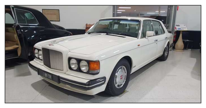
1988 Bentley Turbo Sedan