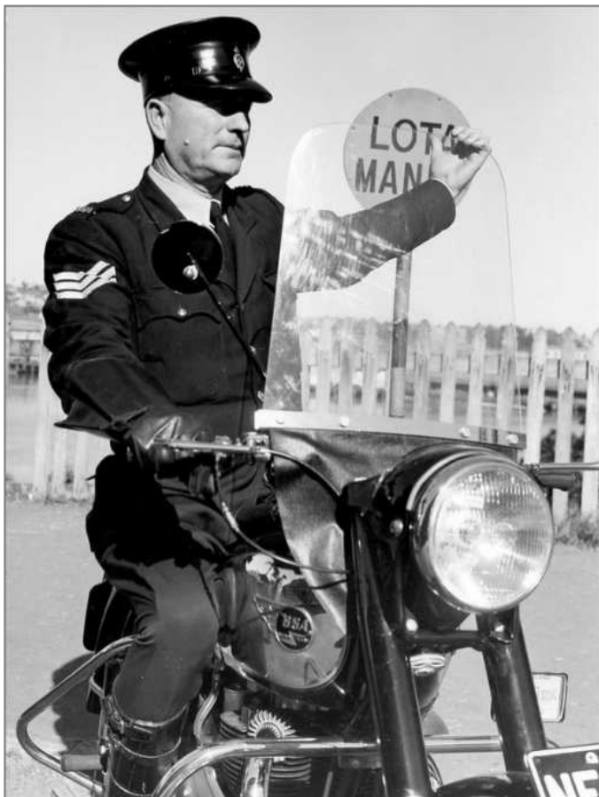
Motorcycle Policeman on a BSA