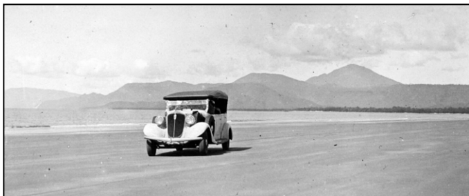
Driving on the beach, Port Douglas c 1935

without making a negative impact on the carbon footprint."