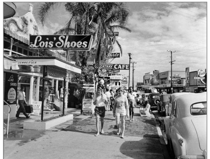
Surfers Paradise, CC 1960

If you wish to be added to the distribution list please email the Editor.